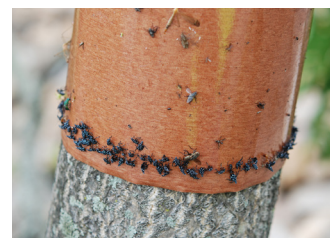
Figure 4. A banded tree with SLF nymphs stuck at the bottom.

Any tree can be banded, but we recommend specifically banding tree-of-heaven, the preferred host, or trees where you see a lot of egg masses or nymphs (Figure 4). Special tape for this purpose can be purchased, though duct tape wrapped backward and tight to the tree also works well. Push pins can be used to secure the band. Adult SLF will avoid tape, so it is essential to band trees in the spring when there are nymphs. Be advised that birds and small mammals stuck to the tape, while rare, have been reported. Check and change traps every other week.