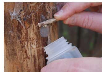
Figure 3. Scraping SLF egg masses from a tree.

This is the most effective way to kill the eggs, but they can also be smashed or burned. Remember that some eggs will be laid at the tops of trees and may not be possible to reach.